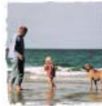
Why we work . . .