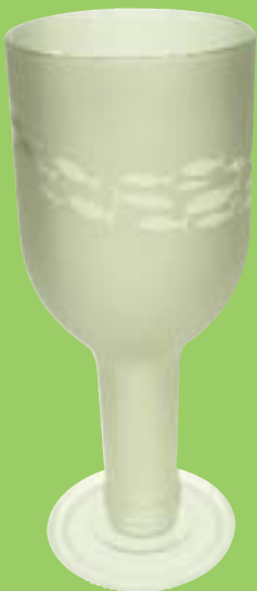
WHITE GOBLET FROSTED FISH Ref: WGFF