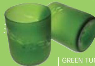
GREEN TUMBLER FROSTED FISH Ref: GTFF