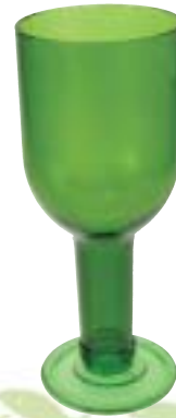
GREEN GOBLET CLEAR Ref: GGC