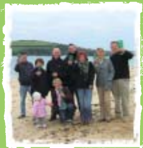
Say hello to the team