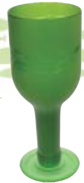
GREEN GOBLET FROSTED FISH Ref: GGFF

This is just a sample of what we make. Visit www.greenglass.co.uk to check out our whole range and new designs. Ordering from our website is easy too.