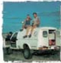
Before Green Glass!