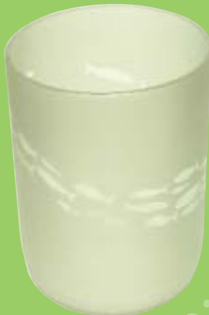
WHITE TUMBLER FROSTED FISH Ref: WTFF