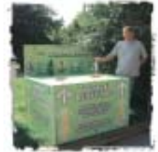
Our first "No Smash" bottle bank