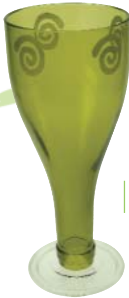
OLIVE FLUTE CLEAR SWIRL Ref: OFCS