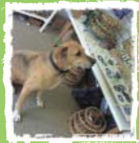
Sassy helps with sales in the factory shop