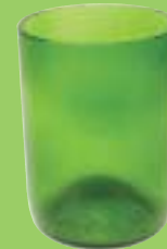
GREEN TUMBLER CLEAR Ref: GTC