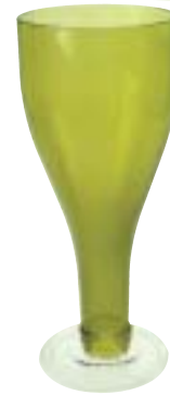
OLIVE FLUTE CLEAR Ref: OFC