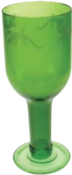
GREEN GOBLET CLEAR GECKO Ref: GGCG