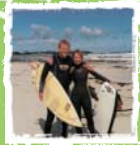
Company board meeting!