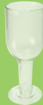
WHITE GOBLET CLEAR Ref: WGC