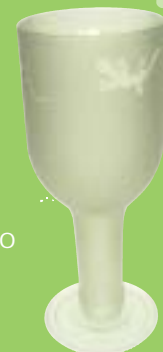
WHITE GOBLET FROSTED GECKO Ref: WGFG