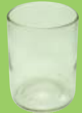
WHITE TUMBLER CLEAR Ref: WTC