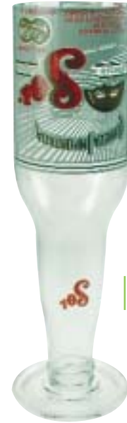
SOL GOBLET Ref: SOL

This is just a sample of what we make. Visit www.greenglass.co.uk to check out our whole range and new designs. Ordering from our website is easy too.