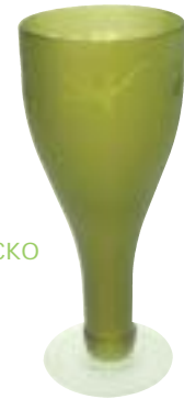
OLIVE FLUTE FROSTED GECKO Ref: OFFG

This is just a sample of what we make. Visit www.greenglass.co.uk to check out our whole range and new designs. Ordering from our website is easy too.