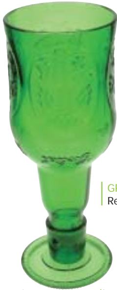
GROLSCH GOBLET Ref: GROL