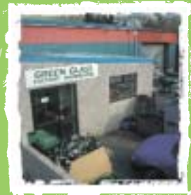
Where it all happens!